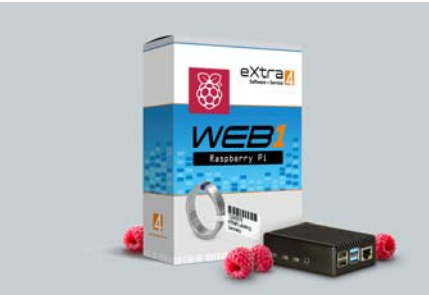
Fig.1: Platform-independent label printing for jewellery and watches with allin system eXtra4-webPl from eXtra4 Software + Service: Single-board computer Raspberry Pi with software eXtra4<web1>