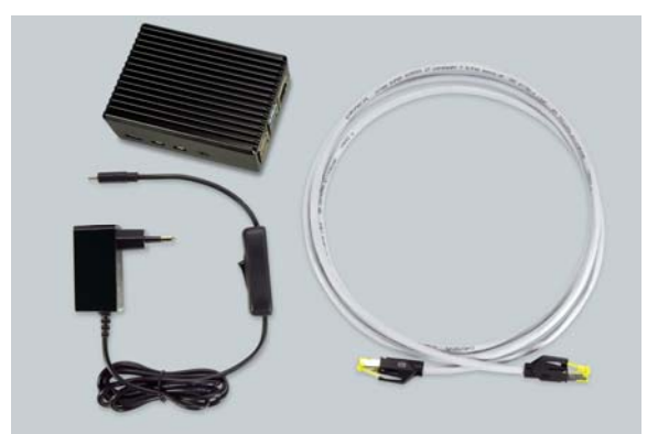
Fig.2: Scope of delivery of eXtra4-webPI: pre-installed single-board computer Raspberry Pi with connection cables for power and router or network

Fig.1: Platform-independent label printing for jewellery and watches with allin system eXtra4-webPl from eXtra4 Software + Service: Single-board computer Raspberry Pi with software eXtra4<web1>